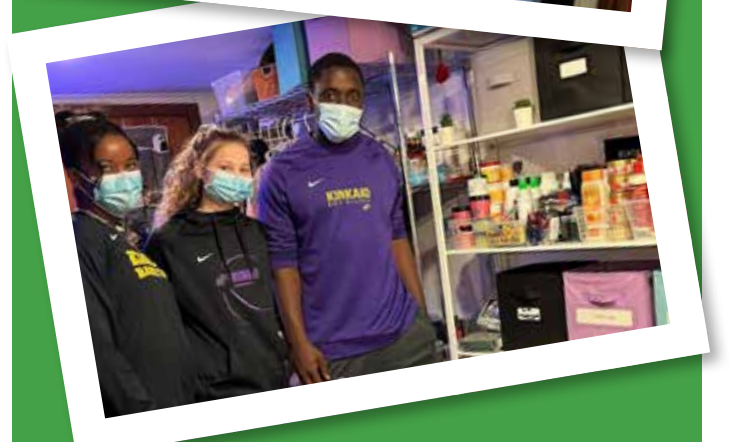
Youth Night services pivoted to to-go style meals, with masked volunteers continuing to show up and support our youth.