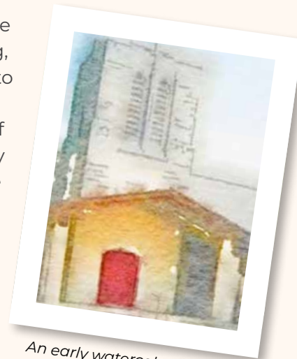
An early watercolor painting of Grace Lutheran Church.

We will always be grateful for our partnership and friendship with Kindred Montrose, and thank them for helping us create a space for the youth we serve.